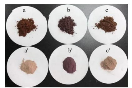
Fig. 1. (a) Grape seeds powder; (b) grape skin powder; (c) grape pomace powder; (a') defatted wine grape seeds powder; (b') defatted wine grape skin powder; (c') defatted grape pomace powder.

The Cabernet Sauvignon grapes were first fermented with 1 wt% distillery yeast at 25 °C for 7 days. Then, using a laboratory-scale extruder (Shanghai Yulushiye Instrument Co., Ltd., Shanghai, China), the GP was collected and washed four to five times with water. By contrast, the GSK and GS were gathered manually. The GP, GSK, and GS samples were then placed outdoors for dehydration to a water content of approximately 65 wt%, following which they were transferred to an air-dry oven at 50 °C for 80 h. The dried GP, GSK, and GS samples were then individually crushed using a laboratory-scale pulverizer (Shanghai Zhikai Powder Machinery Manufacturing Co., Ltd., Shanghai, China) and passed through an 80 mesh screen to gather powders with a particle diameter of >40.52 \mu m (Fig. 1).